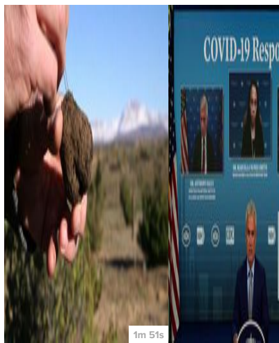
South African truffle grower... 1m 51s