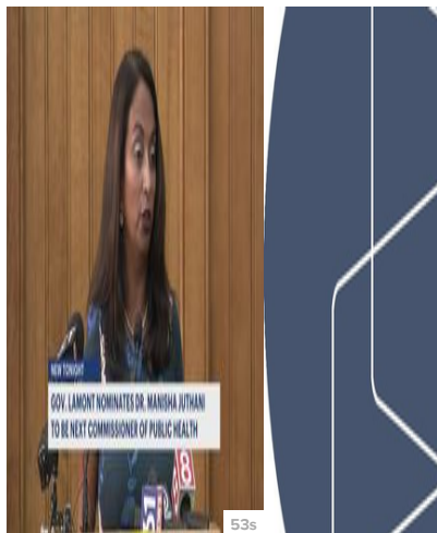
Gov. Lamont nominates Yale... 53s

Dr. Anthony Fauci says Americans can expect to see more children in with the coronavirus